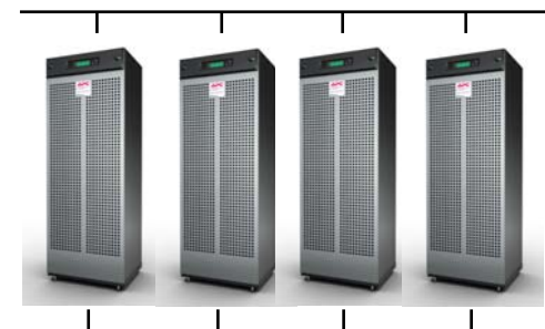
4 units in parallel