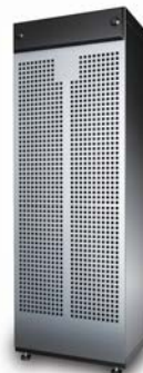
Empty Battery Frame

Enhanced battery module designed for 10-12 years lifecycle for use with zero minute configuration UPS.