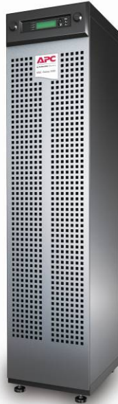
Narrow Enclosure (10/15/20 kVA)

A performance UPS with excellent efficiency and optimized footprint - for commercial and technical facilities up to industrial environments