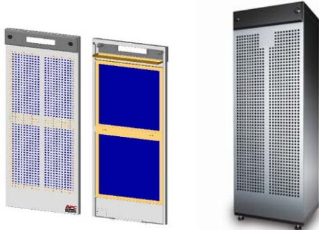
User-replaceable air filters